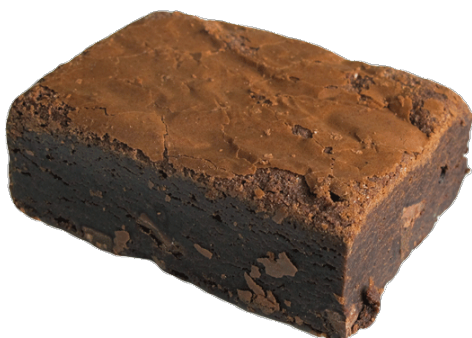
Chocolate Chunk Brownie Made Without Gluten

NEW! Chewy fudge brownie with dark chocolate chunks, made without wheat or gluten.