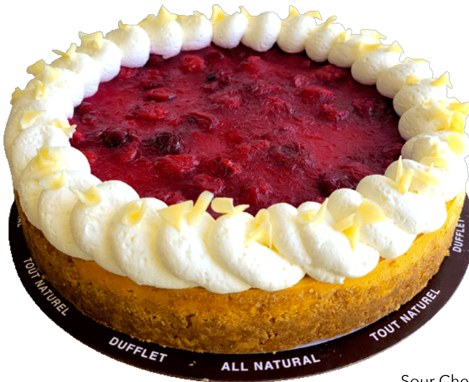
Sour Cherry Cheesecake (8")

Dense and delicious cheesecake in a rich shortbread crust; topped with house-made sour cherry compote; crowned with a fluffy ring of meringue. 38.00