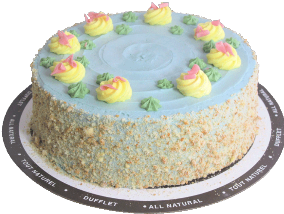
Vanilla Whimsy Cake (8")

NEW! Three layers of vanilla cake with buttercream filling and frosting. 42.00