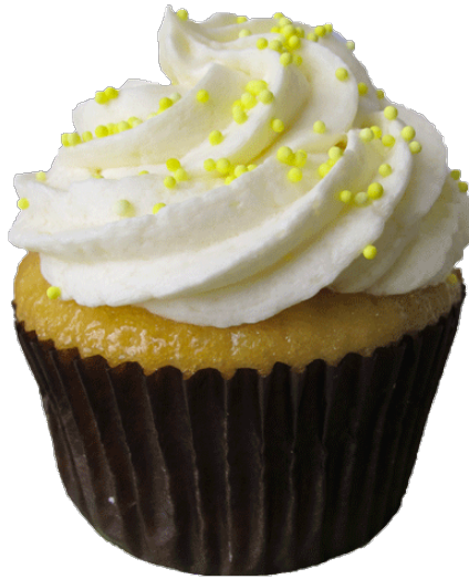
Lemon - 2.5"

Cheerful vanilla cupcake with natural rainbow colours.