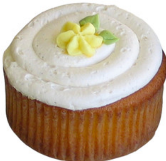
Double Vanilla - 3"

Golden vanilla cake filled with strawberry compote, topped with vanilla and strawberry swirled buttercream; garnished with shortcake crumbs.