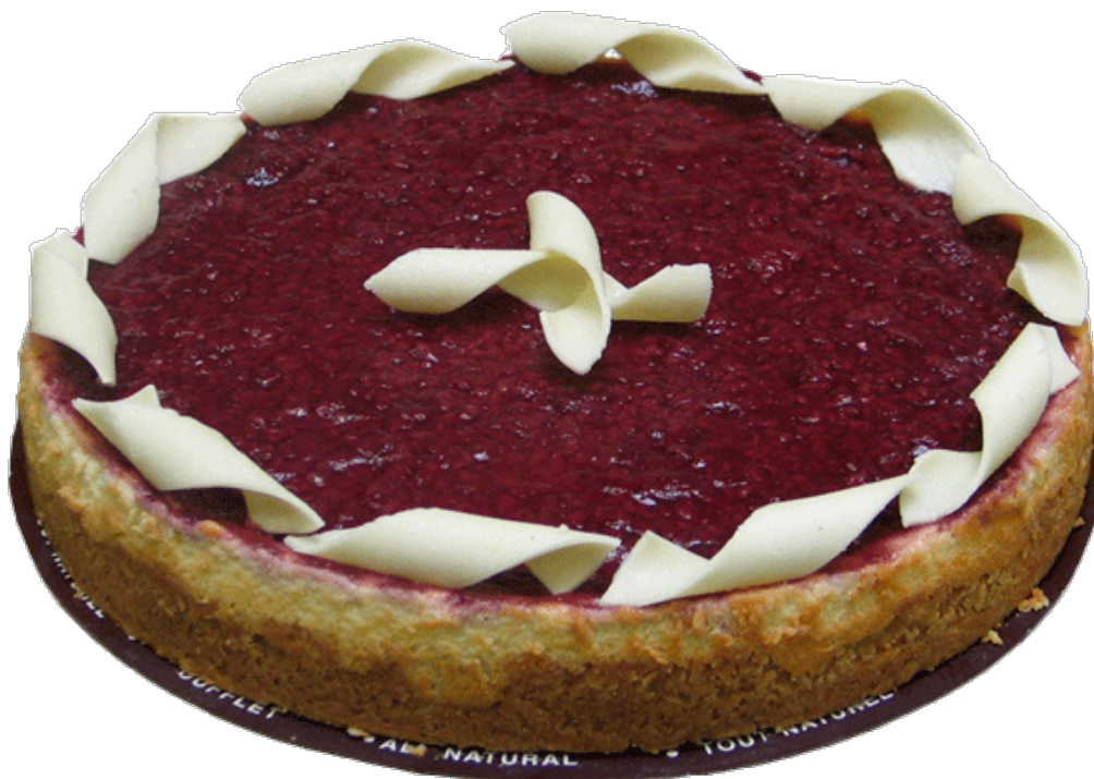
New York Raspberry Cheesecake

Dense and delicious caramel cheesecake in a rich shortbread crust; finished with a shiny caramel glaze and toasted meringue. 34.95