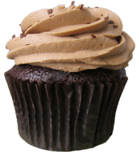
Chocolate - 2.5"

Vanilla cupcake with lemon frosting and topped with sprinkles.