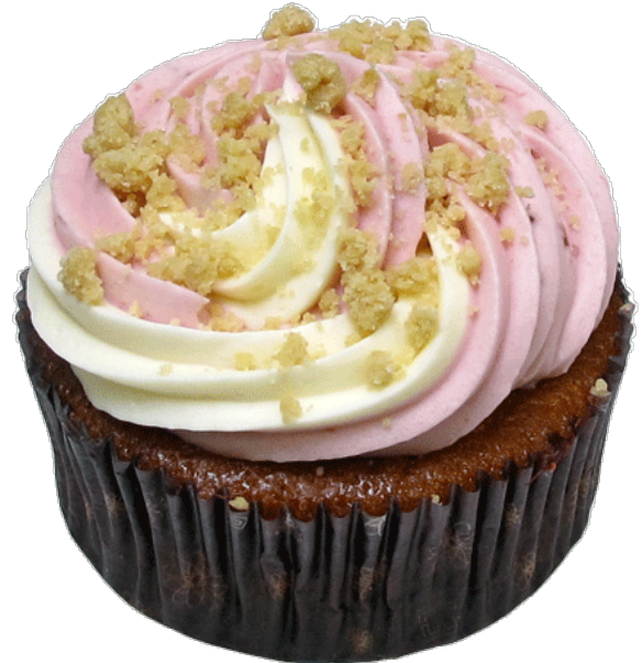
Strawberry Shortcake - 3" filled

Chocolate fudge cake with shiny chocolate glaze topped with crispy pearls.