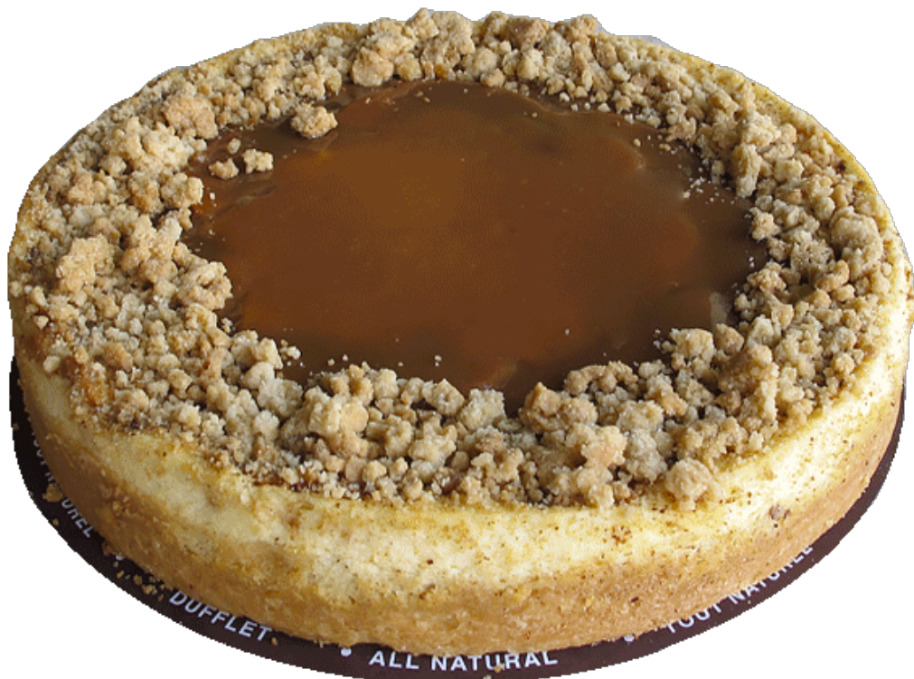
Toffee Apple Cheesecake (8")

Dense and delicious cheesecake in a rich shortbread crust; topped with fresh apple slices and gooey caramel; crusted with toasted streusel. 34.95