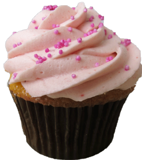
Strawberry - 2.5"

Vanilla cupcake with vanilla frosting and topped with sprinkles.