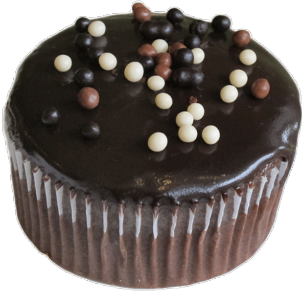
Chocolate Fudge - 3"

Minimum 6 cupcakes per flavour. 4.50 per cupcake