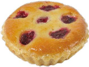
Sour Cherry Almond