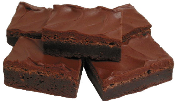
Iced Brownie (nut free)