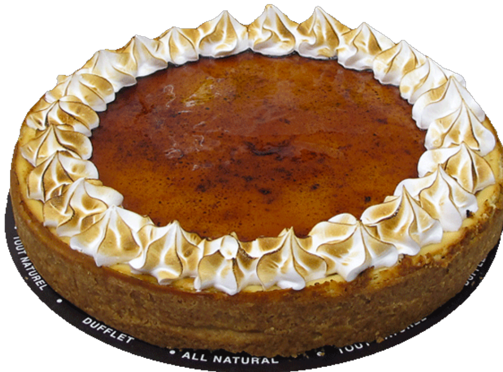
Crème Brûlée Cheesecake (8")

Dense and delicious caramel cheesecake in a rich shortbread crust; finished with a shiny caramel glaze and toasted meringue. 34.95