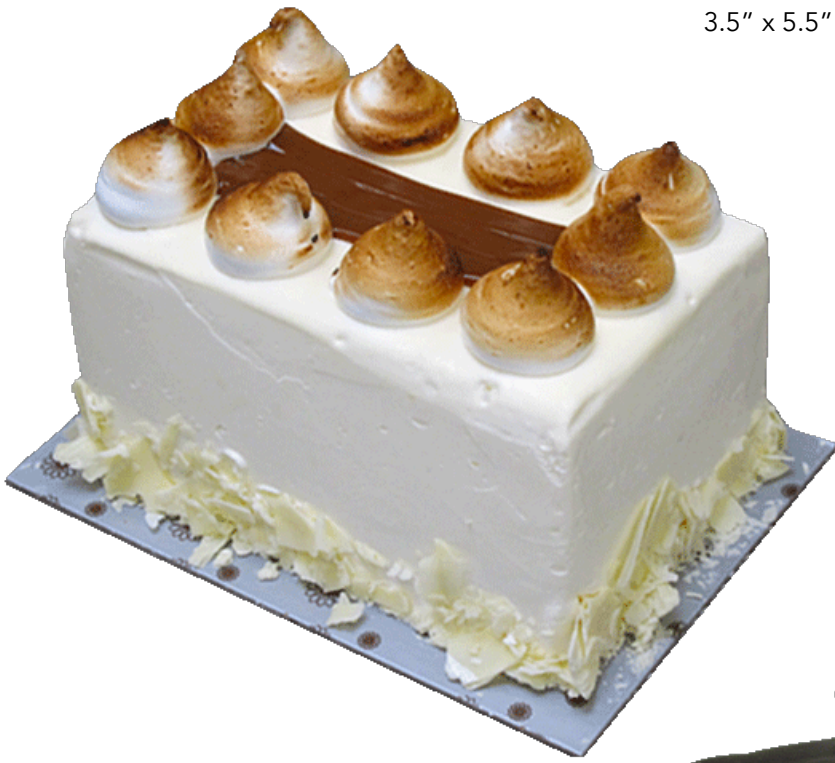
Dulche de Leche Cakelet

Layers of classic white sponge cake and vanilla mousse drizzled with Dulce de Leche; finished with toasted meringue. 19.95