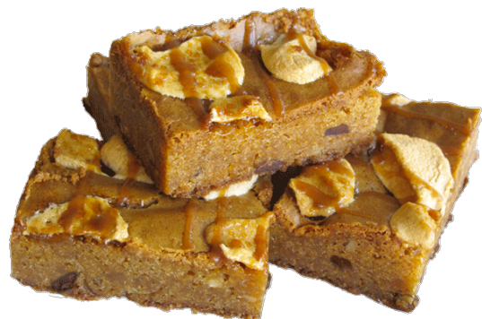
Rocky Blondie Bar