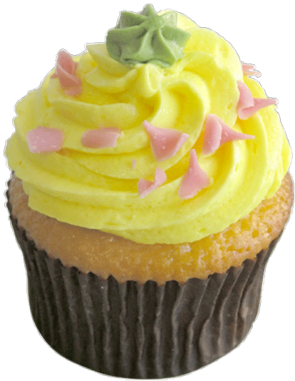
Rainbow - 2.5"

Cheerful vanilla cupcake with natural rainbow colours.