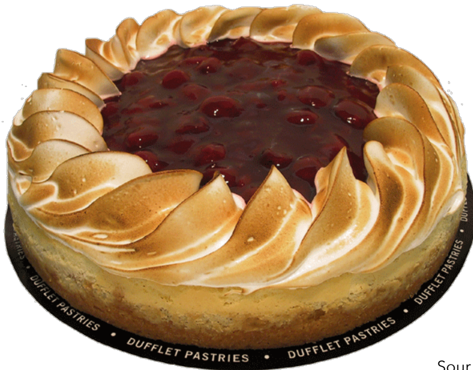
Sour Cherry Cheesecake

Dense and delicious cheesecake in a rich shortbread crust; topped with house-made sour cherry compote; crowned with a fluffy ring of meringue.