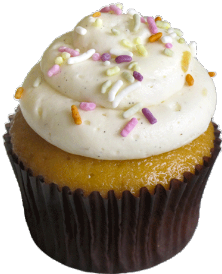
Double Vanilla - 2.5"

Chocolate cupcake with chocolate frosting and topped with sprinkles.